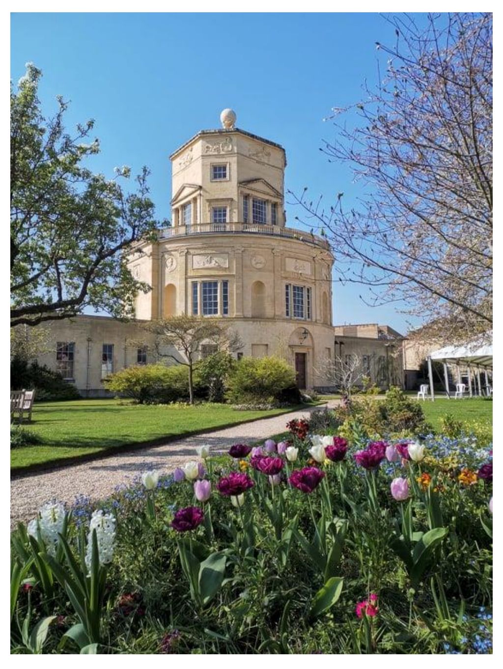
The Radcliffe Observatory, situated in the grounds of Green Templeton College, houses the Newman barometer, an instrument which has provided readings of atmospheric pressure since it was installed in 1838!

July was also considerably warmer than average, with most temperature metrics at least one standard deviation above the long-term mean. A spell of unseasonably high temperatures were recorded during the middle of the month, when maximum temperatures exceeded 25°C for eight consecutive days from the 16th – 23rd. Rainfall (67.7 mm) was normal for the time of year, although was concentrated at the beginning and end of the month, with no precipitation recorded in a ten-day period from the 13th – 22nd. It was also calmer than normal, with average wind speeds (5.6 knots) one standard deviation below the long-term mean for July.