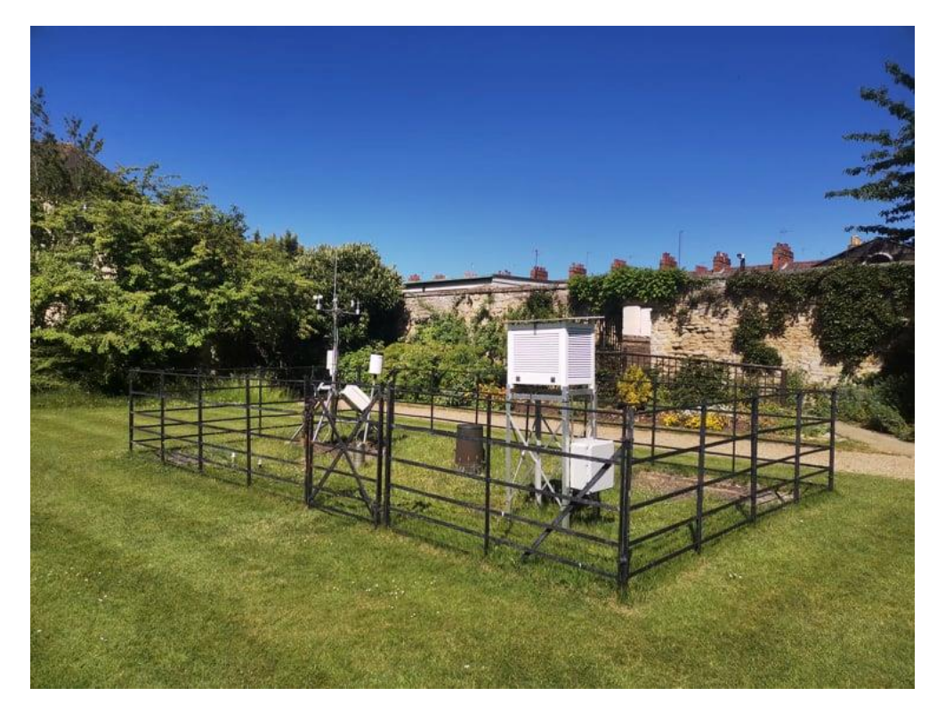
The Radcliffe Met Station.