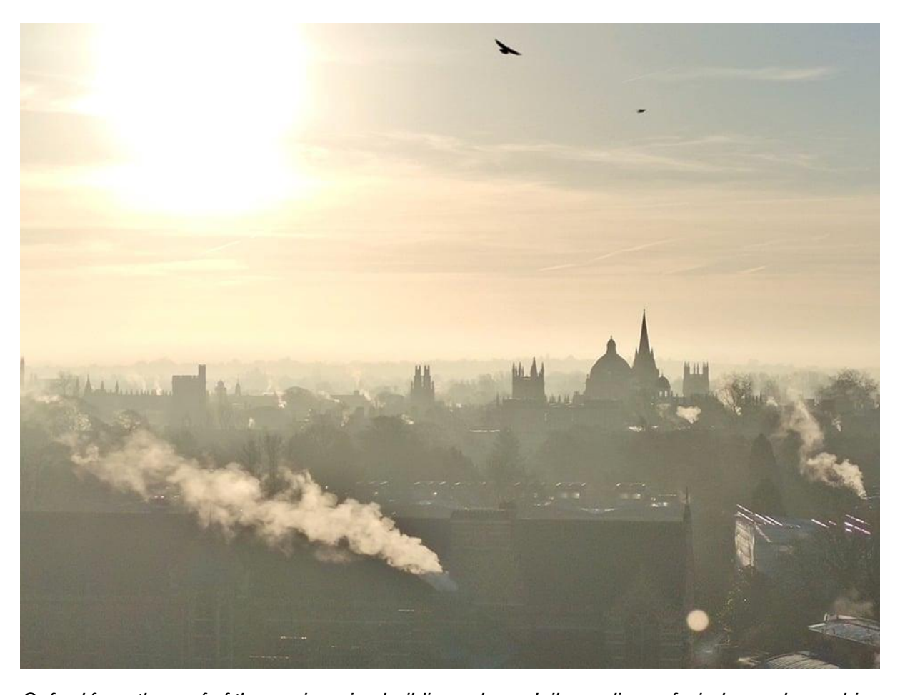
Oxford from the roof of the engineering building, where daily readings of wind speed, sunshine hours and visibility are made.

December was an unseasonably warm month, with a number of the temperature metrics one standard deviation above the long-term average. A mean air temperature of 7.3°C made it the 12<sup>th</sup> warmest December in the Oxford record, however an exceptionally mild end to the month saw the last 3 days of 2021 all break date records for maximum temperature (14.8°C on the 29<sup>th</sup>, 15.3°C on the 30<sup>th</sup>, 15.1°C on the 31<sup>st</sup>), with the 30<sup>th</sup> the 4<sup>th</sup> warmest December day on record. Total rainfall (71.4 mm) was average for the time of year, although the 17.7 mm recorded on the 24<sup>th</sup> made it the wettest Christmas Eve in Oxford since 1924. Total sunshine hours (33.4) were one standard deviation below the long-term mean, making it the dullest December month since 2010.