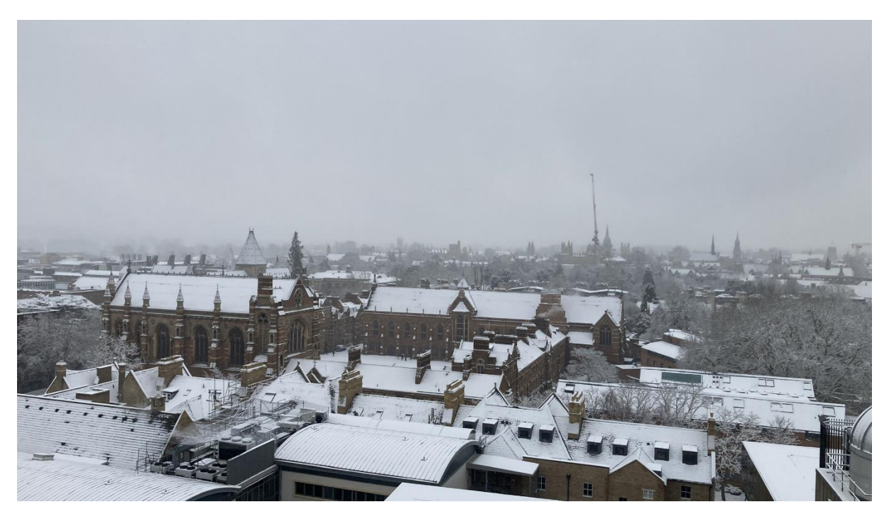
A snowy Oxford landscape during January, observed from the roof of the engineering building.

2021 began with the 5<sup>th</sup> wettest January in the Oxford record (115.3 mm), with high rainfall and the antecedent ground conditions leading to a number of flooding impacts across the county. Indeed, there were 24 rain days during the month, resulting in a sunshine total (41.8 hours) well below the long-term mean. Whilst temperatures were around average (3.7°C), the month was actually the coldest January since 2010, with 7.5cm of snow lying on the 24<sup>th</sup>, the most recorded since the Beast from the East in March 2018.